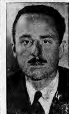
SIR OSWALD MOSLEY

Fences, walls, sidewalks and windows throughout London are being chalked with the words "Stand by the King!" under instructions from Mosley. Under the words the swastika appears. Word has also been passed out for all Fascists to circulate in small groups and to stir up public sentiment against the government. Although this campaign was supposed to be secret, a sound truck toured the West End area near the home of Queen Mary and broadcast this message: "Stand by the King! That is the message