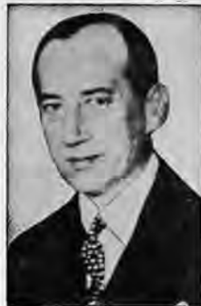
COL. JOSEF BECK

London (WNS)—A polite hint that Poland should treat its minorities, including the Jews, better and that it should improve their economic lot was conveyed to Col. Josef Beck, Polish Foreign Minister, by Anthony Eden, British Foreign Secretary, during their conversation here, it was learned from authoritative sources.