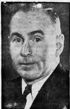
ROBERT E. QUINN For Governor