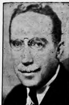
THEODORE FRANCIS GREEN For United States Senator