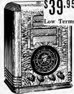
Model No. 5-S-127

1937 Tell-Tale Controls: Take the Mystery out of Radio Tuning.