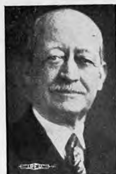
JESSE H. METCALF For U. S. Senator

Safeguard your future and that of your children : :