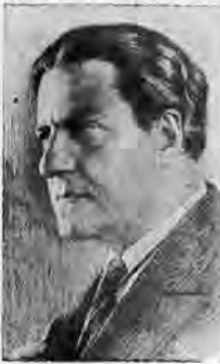
RABBI STEPHEN S. WISE

Rabbi Stephen S. Wise, president of the Zionist Organization of America and head of the World Jewish Congress will speak here tomorrow night at the Metropolitan Theatre. His topic will be "Roosevelt Policies." His visit is being sponsored by the Business Men's League for Franklin D. Roosevelt. The program will begin at 8 o'clock.