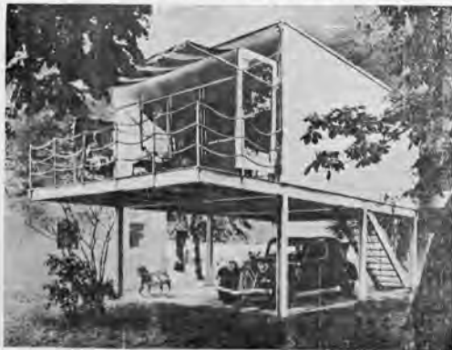
This unusual week-end house was erected on six legs at a vacation point near Stockholm, Sweden. The open space under the house provides space for automobiles. Steel I-beams form the supports and main frame for the structure.