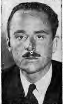
SIR OSWALD MOSLEY