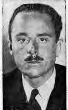
SIR OSWALD MOSLEY