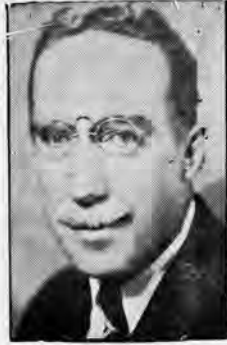
GOV. THEODORE F. GREEN