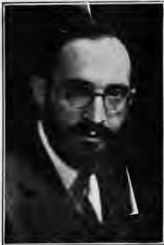
PROF. LOUIS FINKELSTEIN