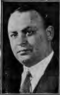
PROF. SELIG BRODETSKY

Johannesburg (WNS-Palcor Agency)—Reaching the largest figure in the history of Palestine fund-raising, surpassing that of any other Jewish community in the world on a per capita basis, South African Jewry has already raised $500,000 in its current Keren Hayesod campaign; it was announced here.