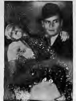
Norman Foster and Evelyn Knapp in "The Arson Racket," which opens at the Victory Theatre tomorrow. In the second feature, Charles Starrett is seen as a lone trooper defying the jinx of a death camp in Peter B. Kyne's "Secret Patrol."