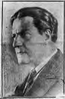
DR. STEPHEN WISE