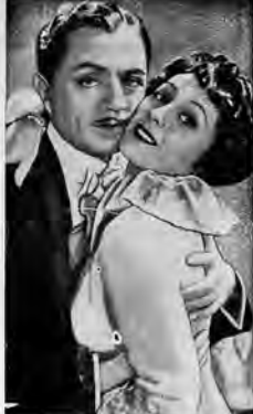
William Powell and Luise Rainer, two of the many stars in "The Great Ziegfeld," which opens today at the Carleton Theatre. The picture tells the story of Florenz Ziegfeld, the man who glorified the American girl.