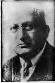
DR. CYRUS ADLER